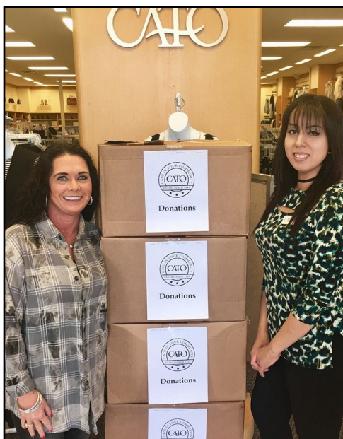
Left, Cato gives us a donation of clothes for the ladies. Below, hard at work cooking and serving at Love & Care in January.