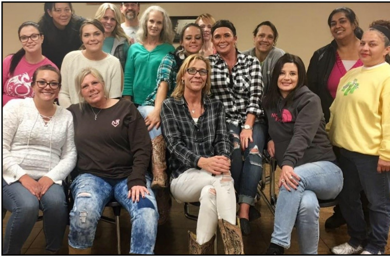
Serving at Love & Care Ministries